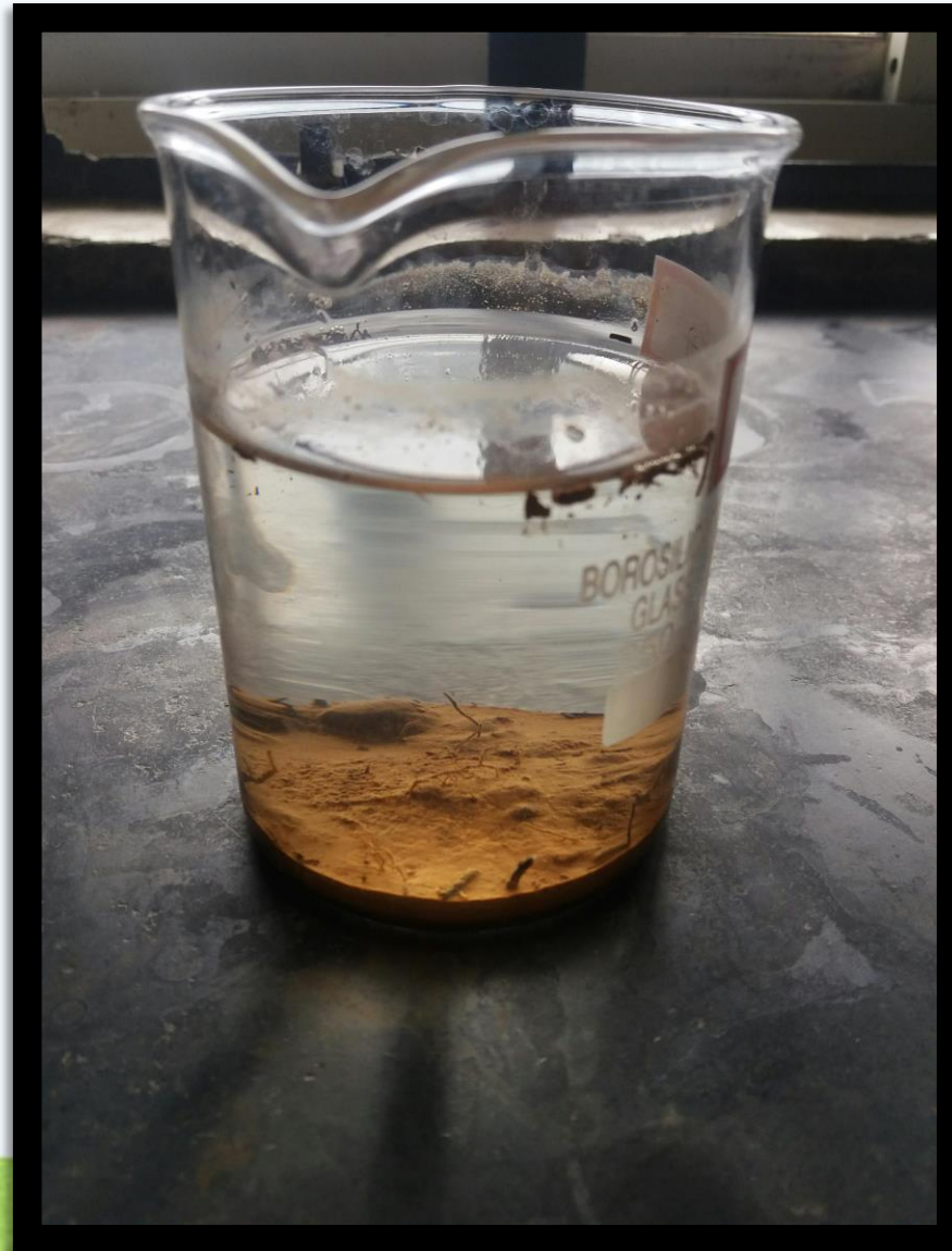
PHOTO OF SOIL SAMPLE AFTER EXPERIMENT